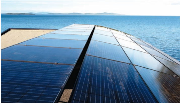
One of the keys to a Net-Zero home is its ability to create its own power, such as with use of solar panels