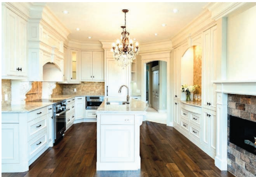
Falcon Heights Contracting homes are always built using the finest finishing and materials throughout