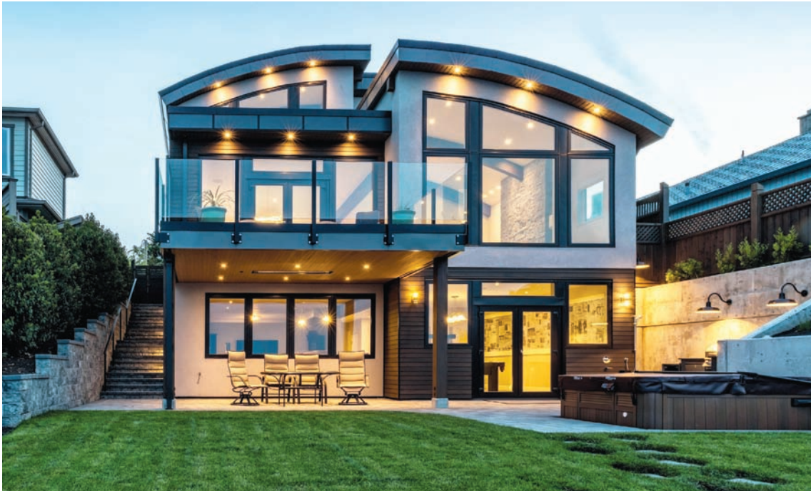
This exceptional Net-Zero home constructed by Falcon Heights Contracting won five gold CARE Awards