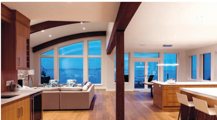
Being extremely energy efficient doesn't mean being uncomfortable, as the interior of the winning home shows