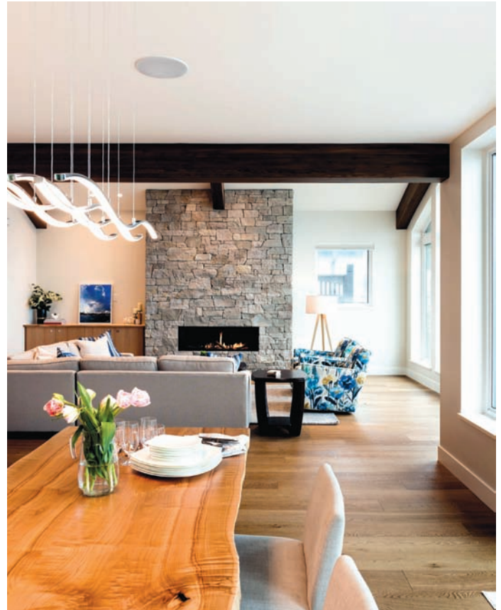
The Net-Zero home has been designed to be open and spacious, and to benefit from a large amount of natural light