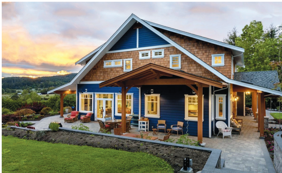
All of the high end custom homes constructed by Falcon Heights Contracting are built to a Platinum Built Green standard

According to information released by the Canada Mortgage and Housing Corporation (CMHC) NZE homes also reduce the impact of housing on the natural environment by reducing energy-related pollutant emissions to the land, water and air – pollutants that potentially could contribute to climate change. Homes of this