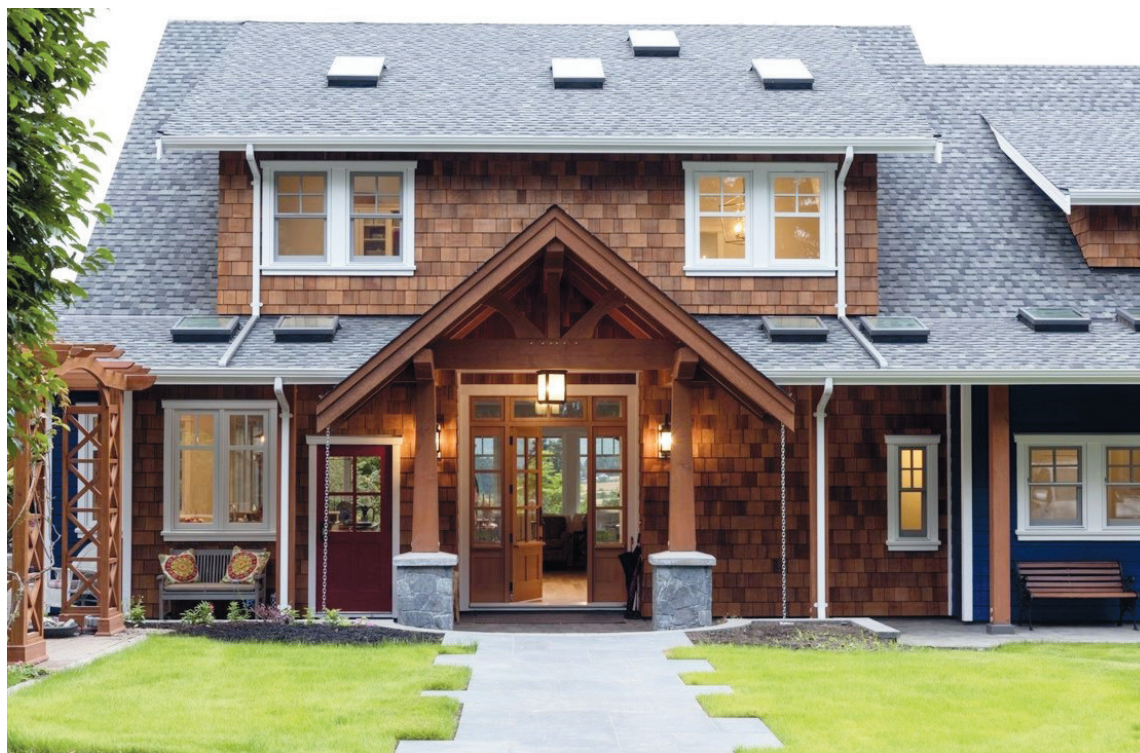
The benefit of a custom home is that it can be configured to meet the exact needs and budget of the homeowner

Organized each year by the Victoria Residential Builders Association (VRBA), the CARE Awards are held to recognize the finest in West Coast home construction and are considered one of the top honours in the profession. At this year's event, attended by more