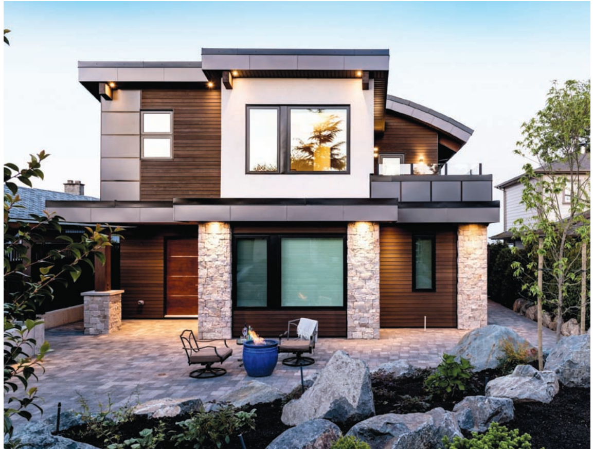
This rear view of the Net-Zero home shows off the home's elegant and rustic backyard – perfect for that morning coffee

"Our goal is to stay at the forefront, in an industry that is always