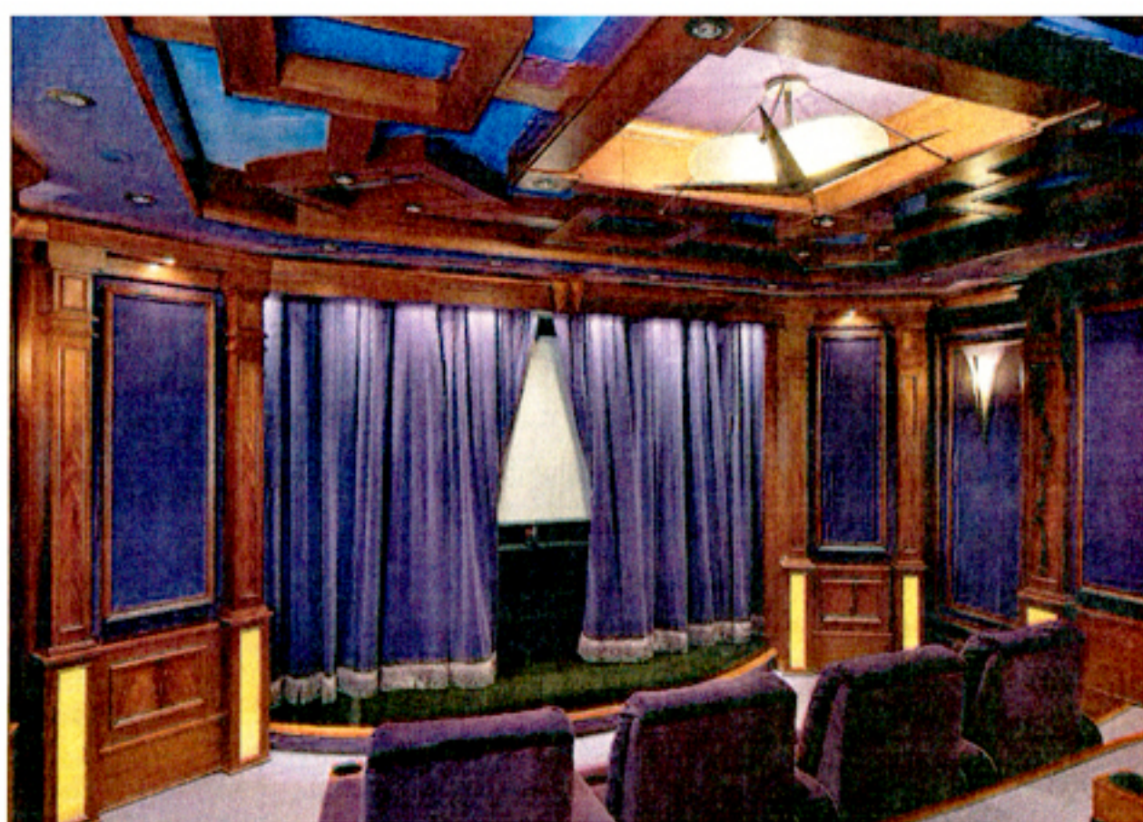
Hillcrest won for Best Media Room. African Crotched Mahogany adorns the walls and ceiling of this room, which includes eight reclining chairs with matching ottomans.