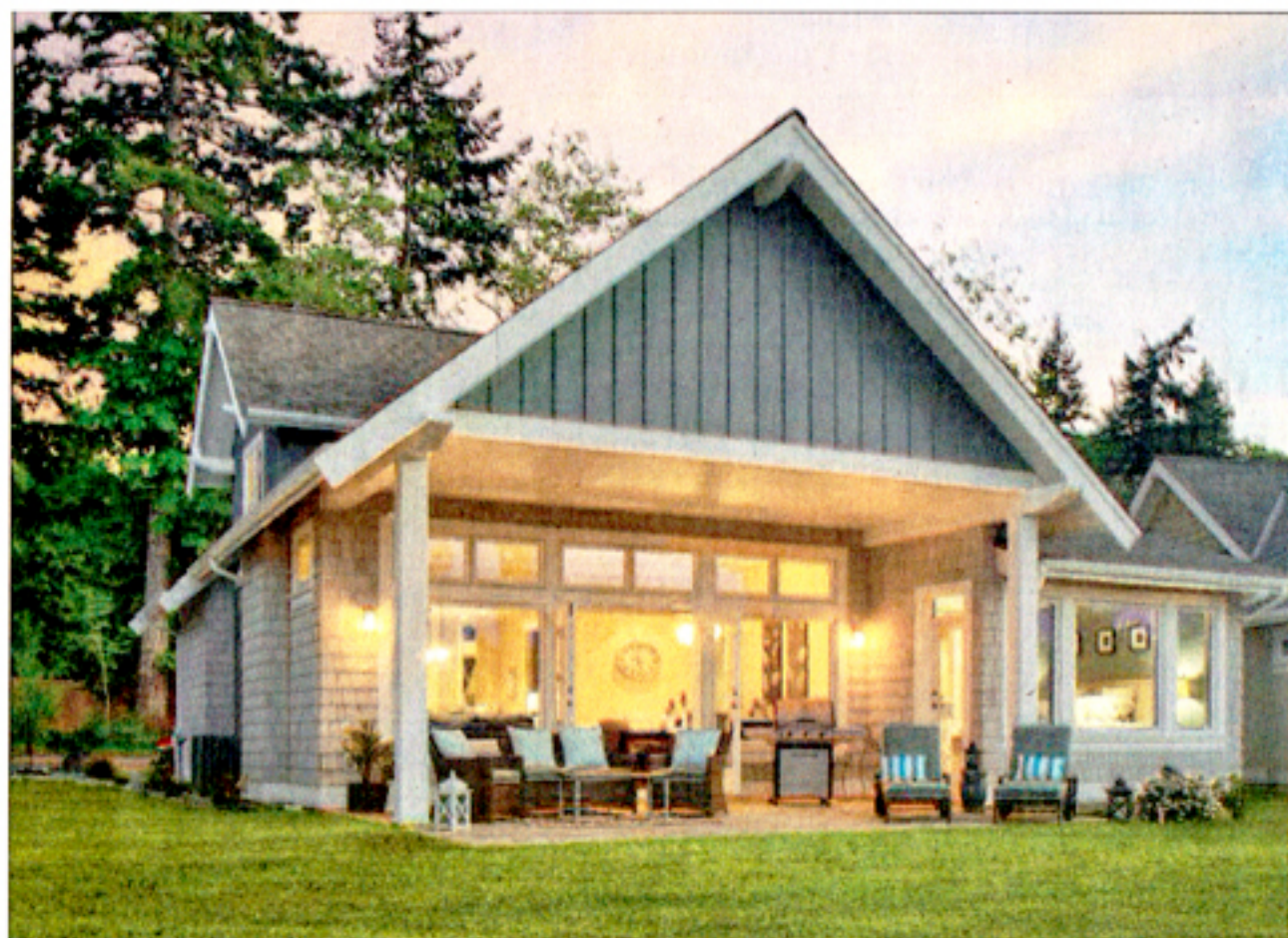
Best Single Family Detached Spec Home under 2,000 square feet, the Cross residence is a Cape Cod cottage-style three-bedroom home that features board-and-batten siding.