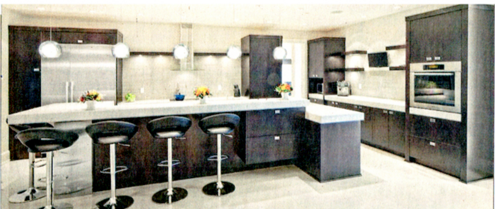
Sea Breeze won for Best Kitchen (new or renovated) over 400 square feet. Custom walnut millwork wraps around the space, while counters are four-inch white and grey quartz.

A simple request for "a really neat" front door by a client snowballed into a one-of-a-kind theme home that stole the night at the recent Vancouver Island Canadian Home Builders' Association CARE (Construction Achievements and Renovations of Excellence) awards.