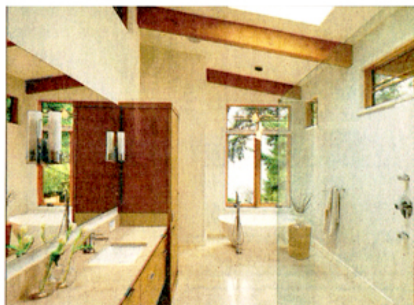
Best Master Suite over 500 square feet, the Peninsula's ensuite includes a computerized lighting system.