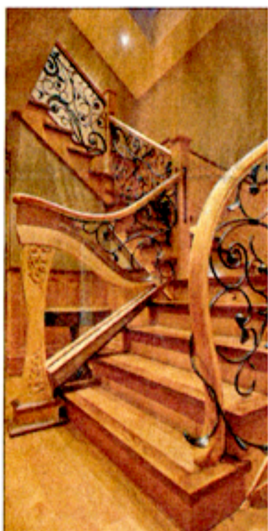
Music by the Sea staircase, with functioning harp at the bottom.