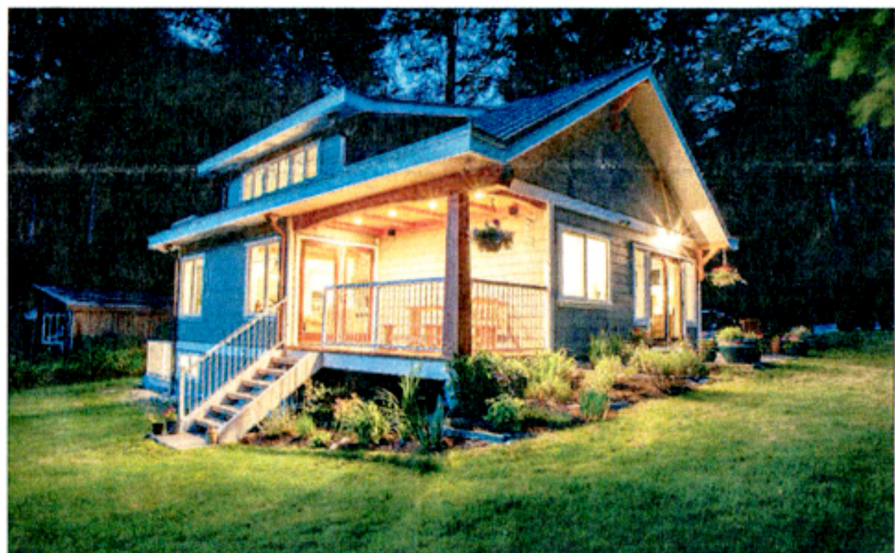
Falcon House, which started as a 750-square-foot cabin, won for Best Residential Renovation or Restoration $125,000 to $300,000.